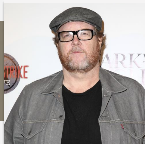
The Mirror Man